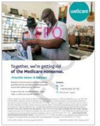
Provider Co-Marketing Some items available in Spa/Chi/Kor