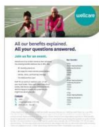
Event Promotion Available in Spa/Chi/Kor/Viet