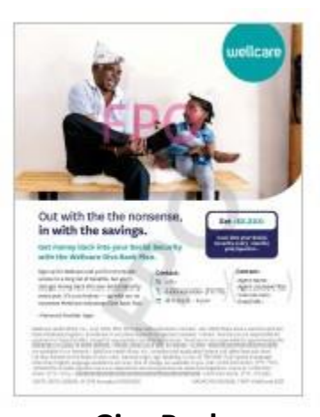
Give Back Available in Spanish