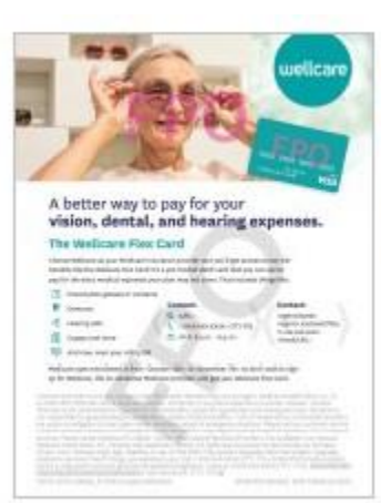
Flex Card Available in Spanish