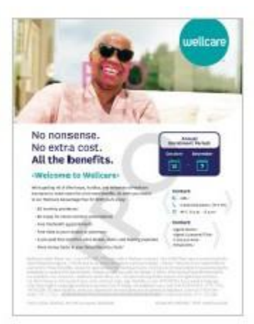
AEP Prime Available in Spa/Chi/Kor/Viet