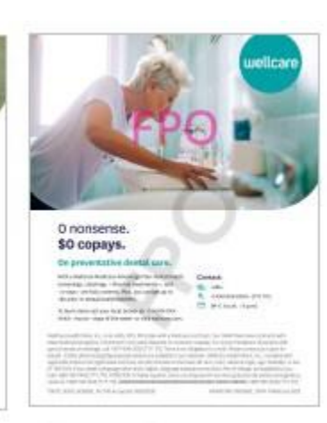
Dental Some items available in Spanish